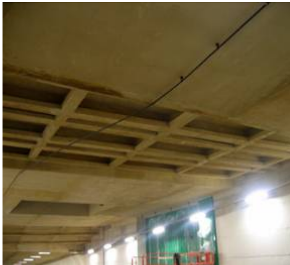
Steel structures installed