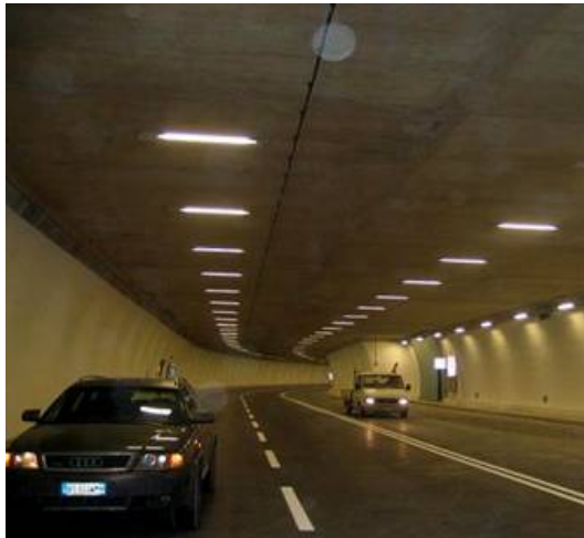
View of central part of tunnel