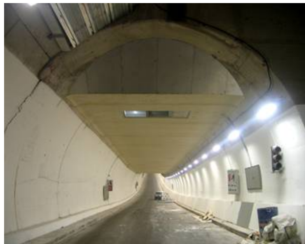
Connecting tunnel in south area