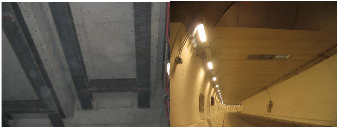
Steel structures during installation of wire mesh

For the concrete structure, Finite Element Modeling was used to determine that a thickness of only 12mm would be sufficient to maintain its temperature below 30 °C during a two hour ISO 834 cellulosic fire.